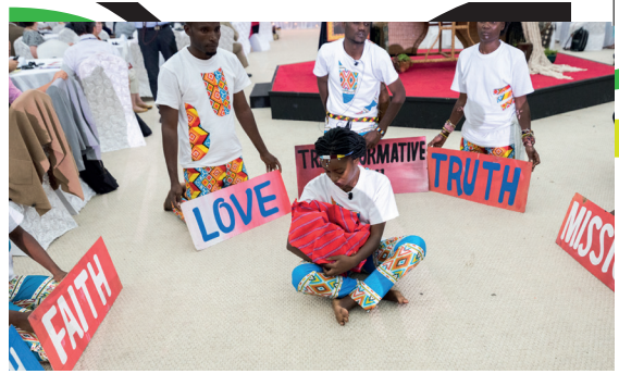
Photo: Norman Tendis - Conference on World Mission and Evangelism 2018