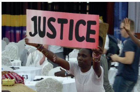
Conference on World Mission and Evangelism 2018

In a world where daily life is more and more dominated by consumerism, and achievements are increasingly measured in terms of money, congregations can be a place of rest: a meeting point without the necessity of buying or paying for something, without judgment of ability to pay, without exclusion. This atmosphere of respect and trust can be the cradle of alternative forms of supply and