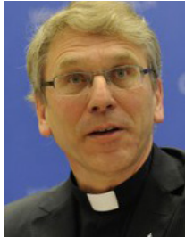
Rev. Dr Olav Fykse Tveit

To arrange interviews please contact the WCC media liaison team: + 33754241861