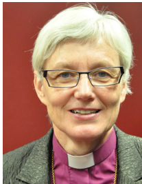
Archbishop Dr Antje Jackelén