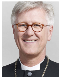
Prof Dr Heinrich Bedford-Strohm

Bishop of the Evangelical Lutheran Church of Bavaria, Chair of the EKD Council.