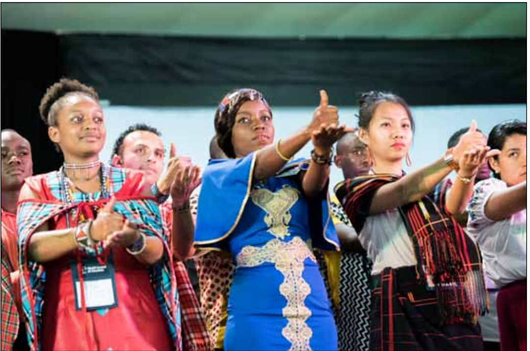
"Amen" in sign language expressed during the plenary session on Mission from the Margins