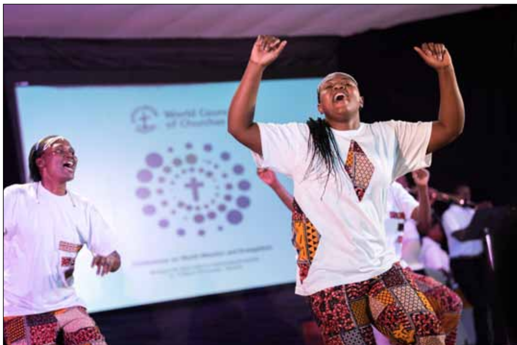
Dancers perform at the opening ceremony of the conference