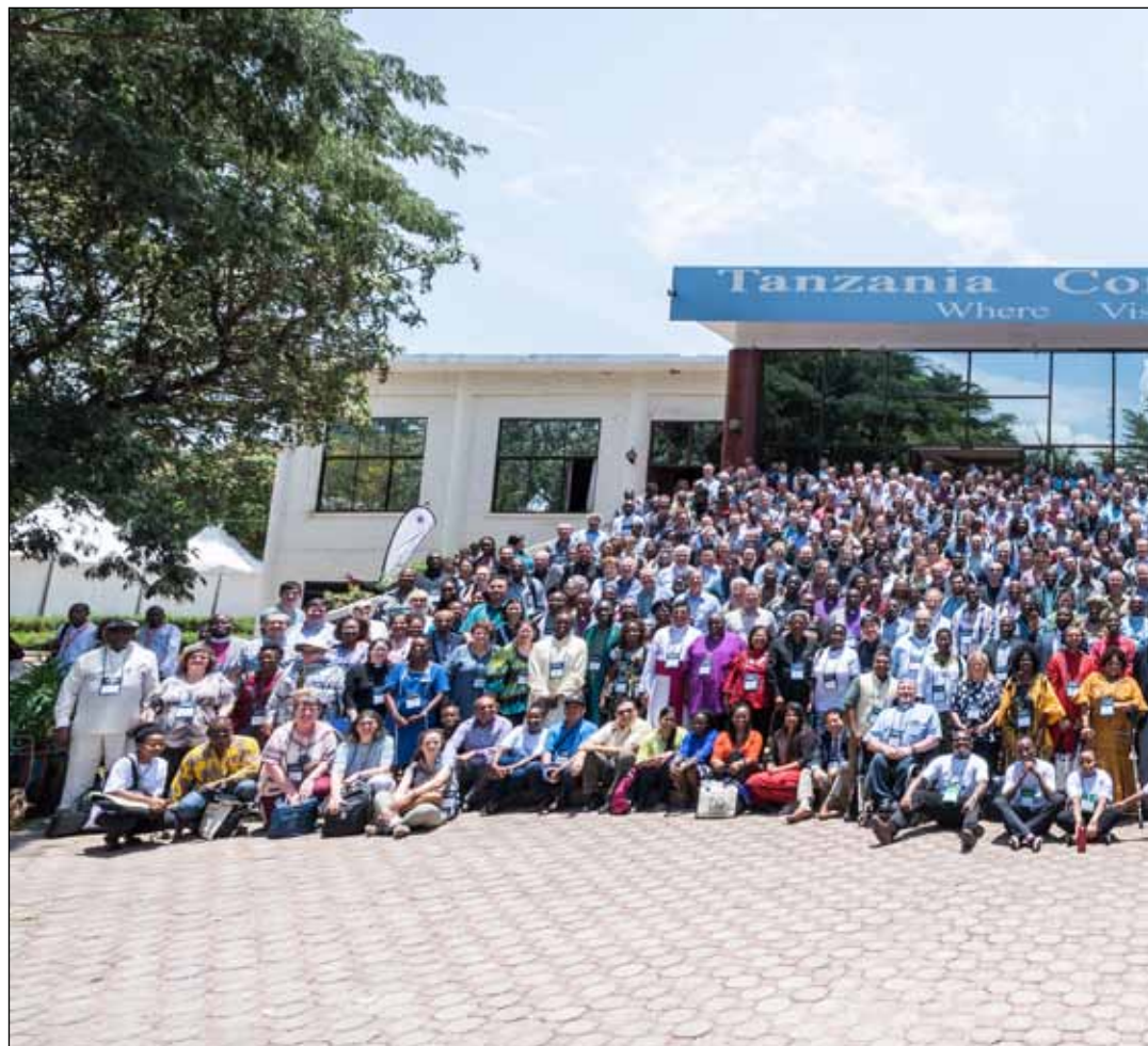
Participants in the WCC Conference on World Mission and Evangelism gather in Arusha, Tanzania, for six days of celebration, reflection, and prayer on "Moving in the Spirit: Called to Transforming Discipleship"