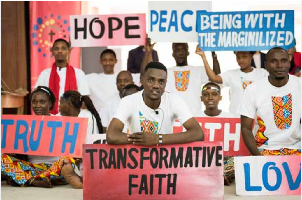
Youth with signs at the Missional Formation plenary