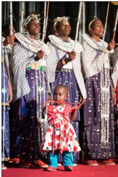
A little girl accompanies her mother, as the choir from the Tanzanian Maasai Tribe performs