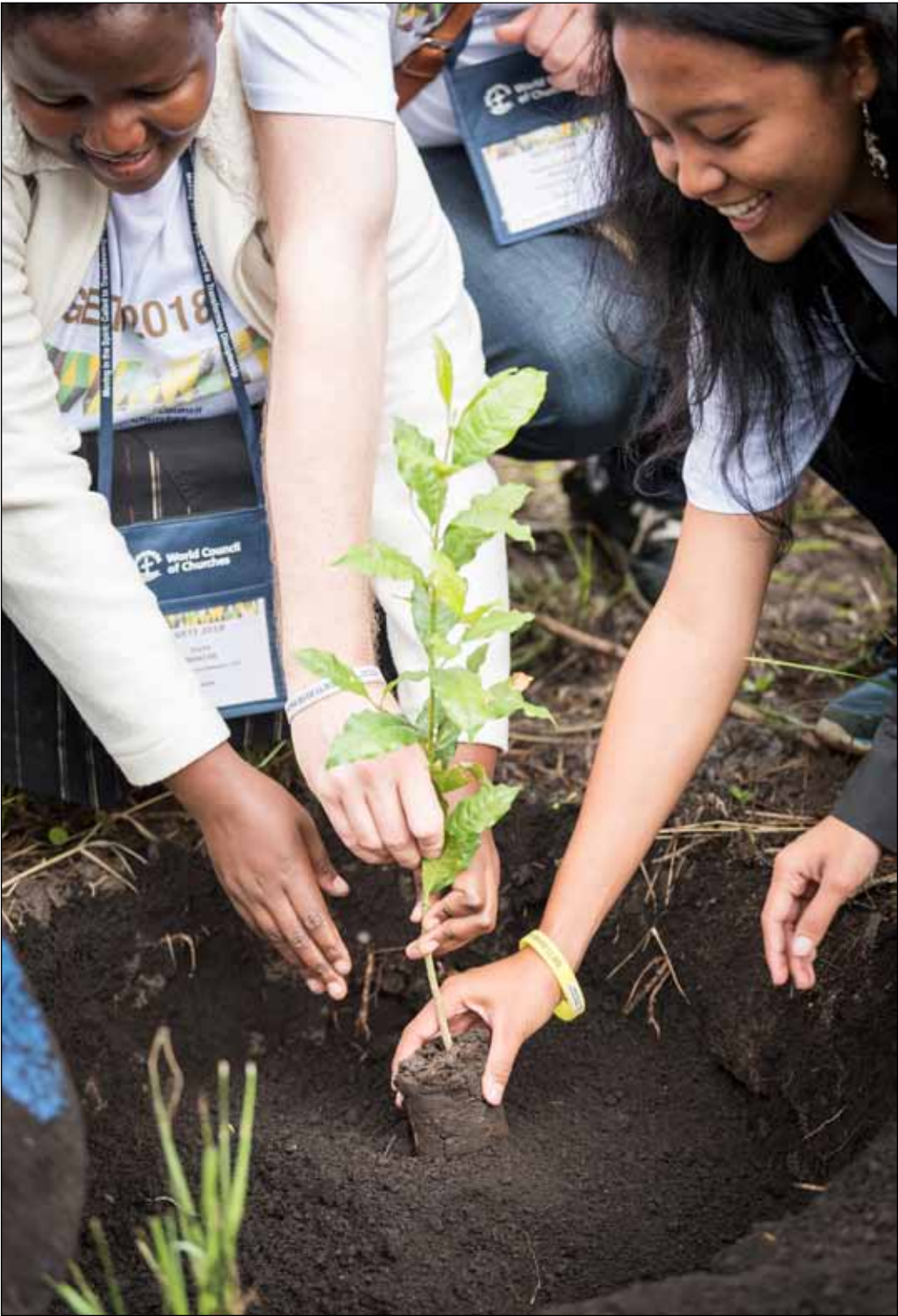
Students plant trees as part of their service learning day