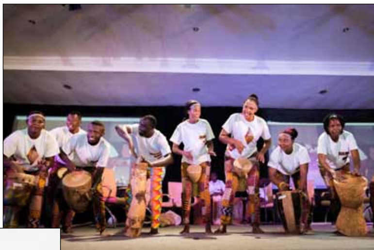
Drummers perform at the plenary session on evangelism