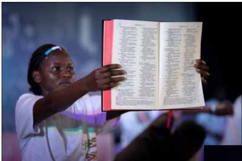
Daily Bible study deeply informed the conference and its understanding of discipleship