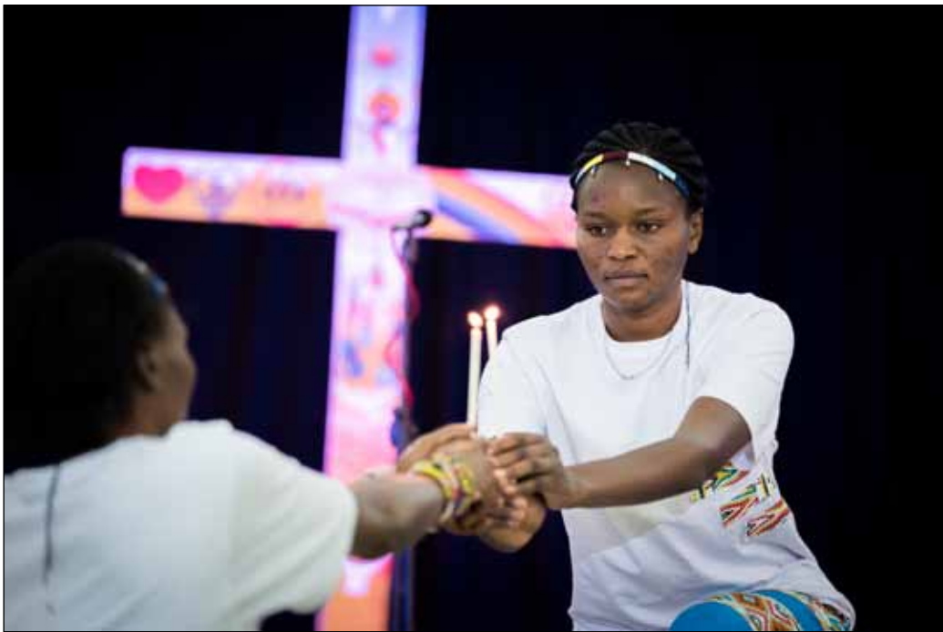
Accepting the flame: morning prayer on the final day of the conference