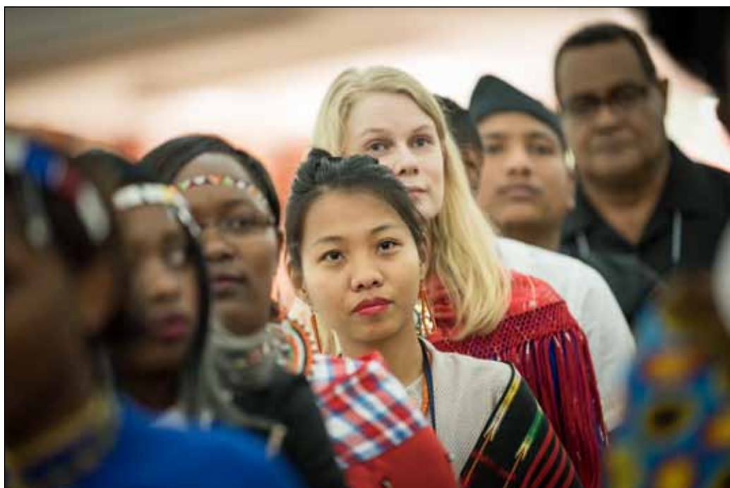
Participants at Mission from the Margins plenary