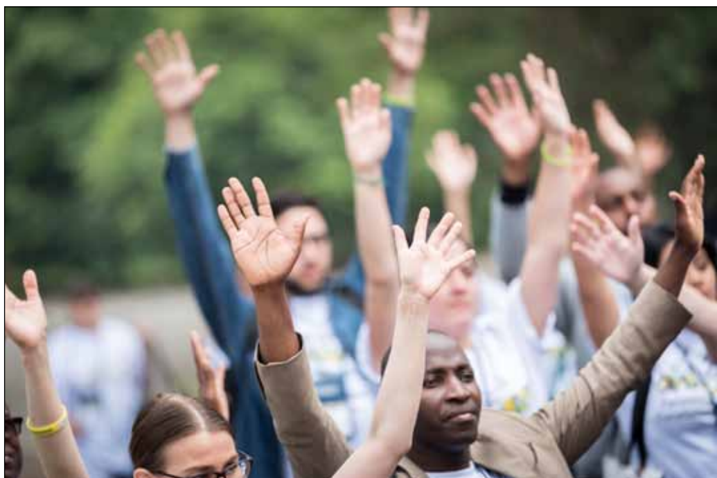
Theological students catch the spirit