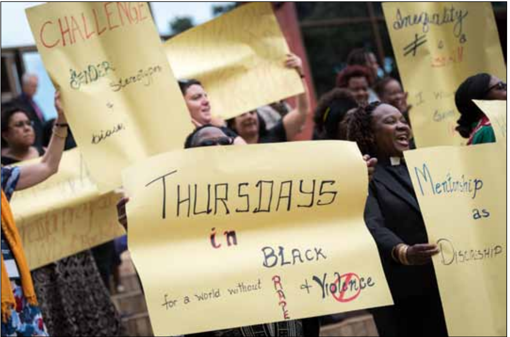
Witnesses delivering a message from the women of the conference