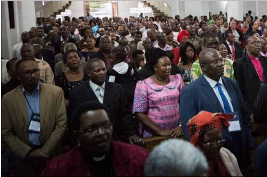
A congregation of over 1,000 people, the Arusha Mjini Kati Lutheran Church gathered to celebrate Sunday service, together with international visitors participating in the conference