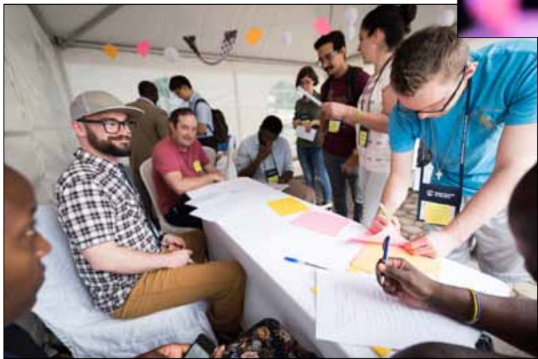
Orange consensus cards were for conference decision-making