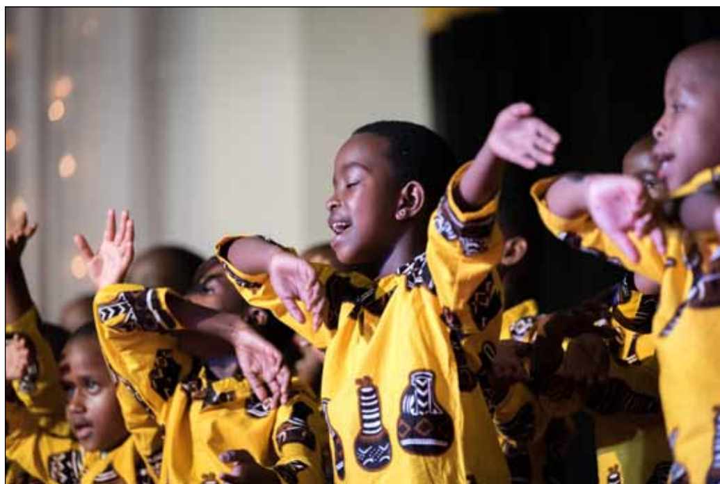
A school choir from Arusha performs at the conference