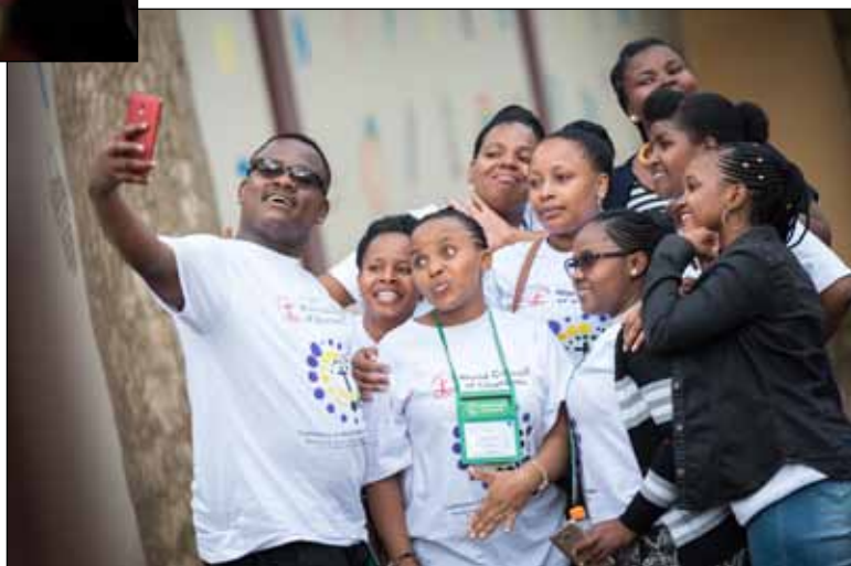
Conference stewards pose for a group selfie