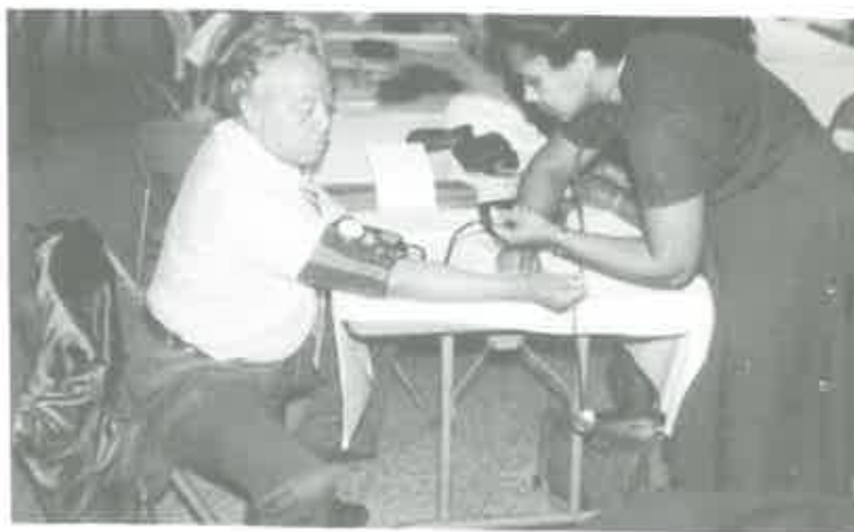
GBSC Health & Human Services Project

Lay Advisor checks fellow congregation member for high blood pressure.