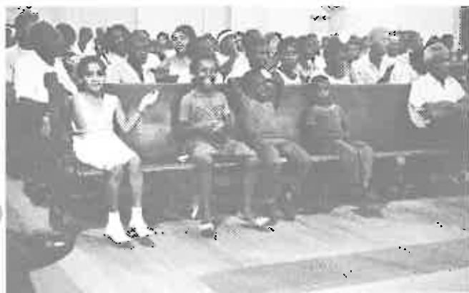
NCCUSA, by K. Thompson

There were and are other Black survival mechanisms, such as our sense of humour or our ability to sort of take things easy. Even some characteristics normally thought of as uncomplimentary may have been and may be part of the whole Black survival mechanism. Not being on time, for instance. In the old days, you wouldn't exactly leap up in the morning to go out and work 16 hours, and you wouldn't hustle through the day to do whatever you