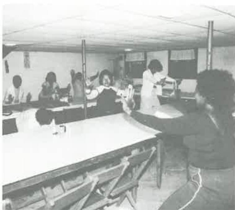
GBSC Health & Human Services Project

Lay Advisors enjoy exercise demonstration during training.