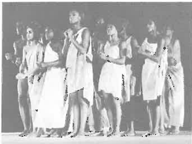
WCC