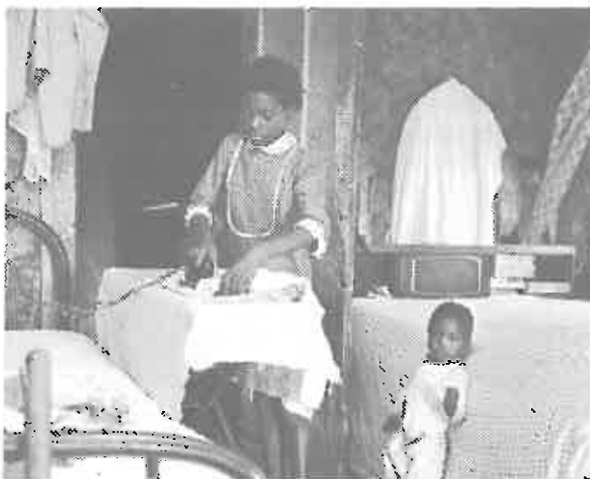
United Methodist Missions, by T. Fujihira

This programme offered a low-cost approach to more appropriate utilization of health care