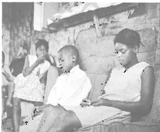
United Methodist Missions

"... far from equal in our housing, our illnesses, our babies dying, our life expectancy, our diet and our access to resources."