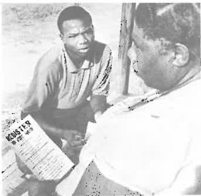
Delta Ministry, Mississippi. United Methodist Missions

The Black church plays a strong role in community development: voter registration by church volunteers.