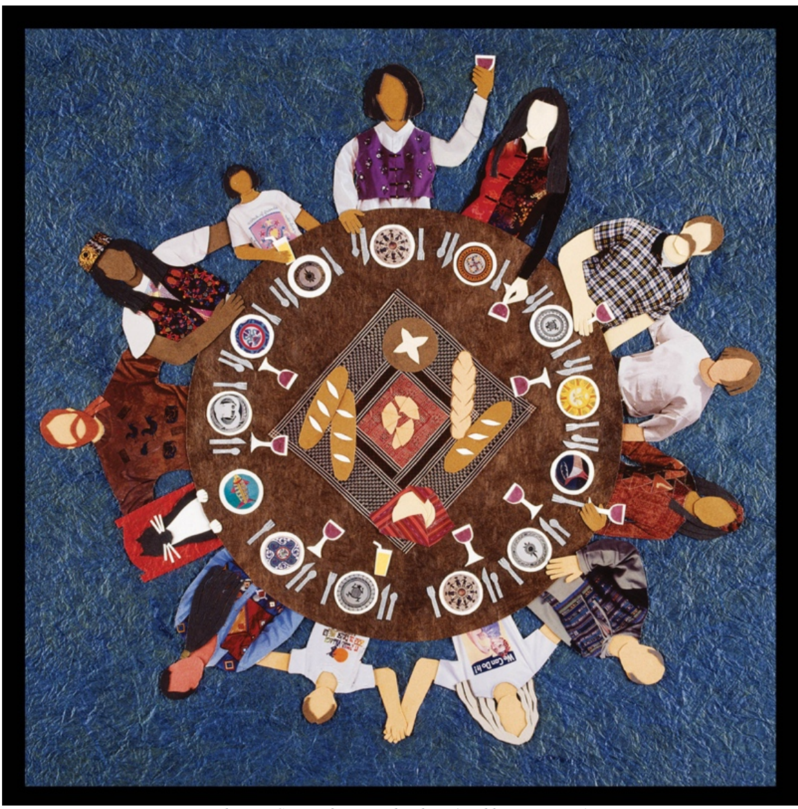
The Best Supper © Jan Richardson (used by permission)

This service of prayer and supporting materials for reflection for the Churches' Week of Action on Food 2019 have been prepared by the World Methodist Council (WMC) in partnership with the World Council of Churches – Ecumenical Advocacy Alliance (WCC-EAA). All materials can be accessed online at: