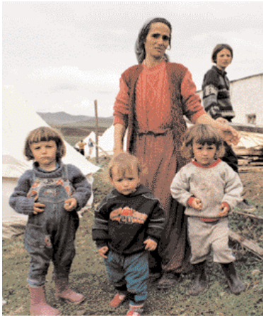
Above: Refugees from Kosovo in Albania during 1999 conflict

Diakonia, the 'responsible service of the gospel by deeds and by words performed by Christians in response to the needs of people', is rooted in and modelled on Christ's service and teachings. Old Testament law provides a variety of ways to alleviate the suffering of the poor. In certain periods of Christian history, Christian care and solidarity have been exemplary and pioneering. In more recent centuries, religious orders (in the Catholic Church), brotherhoods and sisterhoods (in the Orthodox Church) and renewed forms of the diaconate (Protestant churches) have contributed to a specialization and to an institutionalization of social diakonia. Secular 'humanitarian' movements and professional workers also emerged during the 19th Century.