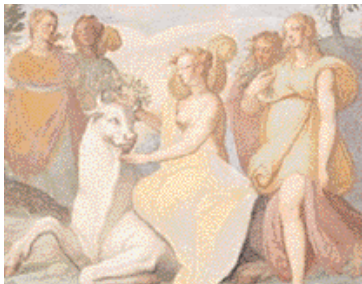
The myth of Europa

According to mythology, Europa was named after Europa, daughter of Agenor, king of Phoenicia. One day, while she was tending her father's flock near Tyre, a splendid, milk-white bull appeared before her. The beautiful Europa decked its horns with flowers and, as she stroked it, mounted its broad back. The bull stood up and plunged with her into the sea, then swam to the island of Crete. The bull, who was none other than Zeus himself, vanished and re-appeared to Europa in his godlike form. From their union was born Minos, the civilizing king of Crete.