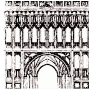
Right: In 1998 statues of those who by their deaths testified to the cost of Christian faith in the 20th Century were set up in Westminster Abbey (London). Drawn from every continent of the world and from many denominations; and they include such well-known names as Martin Luther King, Dietrich Bonhoeffer, and Grand Duchess Elizabeth of Moscow

Roman Catholicism remains the dominant church in most of Western and Southern Europe. The contemporary Catholic Church has been deeply marked by the reforming council of Vatican II. Contemporary Catholicism is characterized by a diversity of practices, including a widespread charismatic revival (from the 1960s), the appearance of immigrant Catholic communities in European countries, and the re-emergence of vigorous Eastern-rite Greek Catholic (Uniate) churches in parts of Eastern Europe after years of communist repression. The collapse of communism, for some observers accelerated by the Polish Pope John Paul II, has been followed by a renewed call for evangelisation of the European continent. At the Special Assemblies for Europe of the Synod of Bishops in Rome in 1991 and again in 1999, the Catholic Church rejoiced in the new-found freedoms, and called for a 'new evangelization' of the continent, rooted in spirituality and holiness.