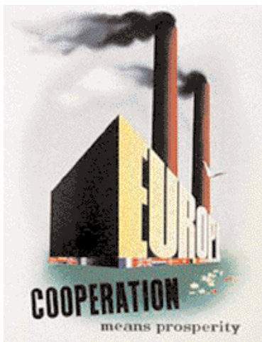
Above: European co-operation focused on economic integration from the outset

The Europe that awoke in the days following the Liberation was in a sorry state, torn apart by five years of war. States were determined to build up their shattered economies, recover their influence and, above all, ensure that such a tragedy could never happen again. Winston Churchill was the first to point to the solution. In his speech of 19 September 1946 in Zurich, he said what was needed was 'a remedy which, as if by miracle, would transform the whole scene and in a few years make all Europe as free and happy as Switzerland is today. We must build a kind of United States of Europe'. Movements of various persuasions, all of them dedicated to European unity, were springing up everywhere at the time.