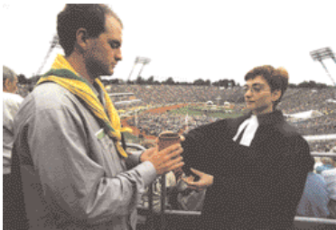
Above: Eucharist during the annual Kirchentag of the German churches, 1997

'Mission is at the very heart of the church. If there is no mission, there is no church.'