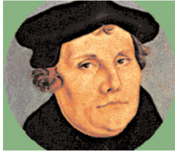
Left: Martin Luther transformed much of Western church thinking in Europe