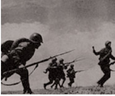
Left: Soviet infantry charge in WW II. Wars have killed an estimated 74 million people in Europe during the 20th Century

Dictionary: 'Official criticism of communism was indeed muted - in the interest of preserving freedom for Christians in communist countries and of ensuring their continued ecumenical participation.' Since files have now become available from some intelligence service archives, the issue has met with renewed interest and new research projects have been launched.