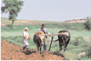
Left: Albanian farmers till the land