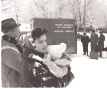
Left: Hungarian refugees fleeing the Soviet invasion. Advocacy with uprooted people has been one of the primary concerns of the WCC