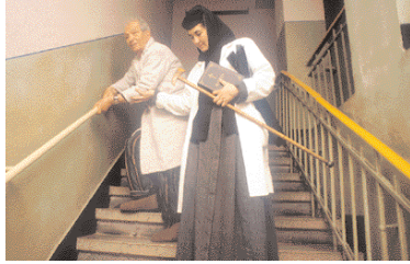
Left: Romanian Orthodox nun assists an elderly man. A tremendous revival in diakonia has taken place in Eastern Europe in recent years

It sponsored a number of ecumenical consultations, in particular the world consultation, Diakonia 2000: Called to be neighbours , in Larnaca in 1986, when churches recognized the need for a more comprehensive, holistic and liberating diakonia aimed at transformation on all levels, and taking into account other, sometimes less obvious, forms of aid than the purely material kind.