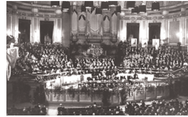
Right: the founding Assembly of the WCC, Amsterdam, 1948

grew out of them, and the related pre-Reformation Waldensian Church and the Church of the Czech Brethren 'affirmed together the common understanding of the Gospel which enables them to declare and to realize church fellowship'.