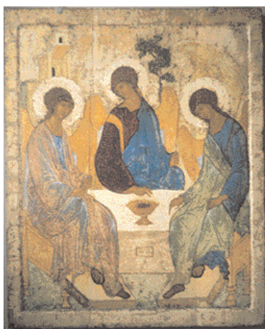
Above: The Hospitality of Abraham depicting the Holy Trinity, by icon painter St. Andrey Rublev, Russia (c.1420)