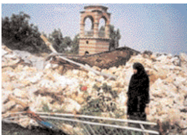
Above: An Orthodox nun surveys one of the many churches destroyed by ongoing inter-ethnic conflicts in Kosovo (1999). WCC has intervened in favour of both Albanian and Serb victims of violence

Interest in and support for human rights issues by the ecumenical movement is demonstrated in the early contributions of the Commission of the Churches on International Affairs (CCIA), which took a major role in drafting the article on religious liberty in the United Nations Universal Declaration on Human Rights and also actively supported provisions in the UN Charter for a commission on human rights. The churches' commitment to human rights issues took a more definite shape in the 1960s and 1970s when local churches in Eastern Europe introduced different insights from those of Western Europe. A landmark consultation entitled 'Human Rights and Christian Responsibility', which convened in St Pölten, Austria in 1974, was preceded by regional meetings. Until then, human rights related ecumenical documents focused on the 'Third World' with a discourse centered on liberation. However, in the following year, ecumenical bodies (WCC, CEC, LWF) and several churches of Europe played an active part in the efforts which led to the Helsinki Agreement on Security and Co-operation in Europe.