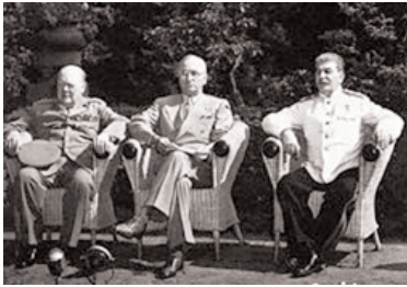
Above: Churchill, Truman and Stalin negotiate the administration of defeated Germany (Potsdam, July/August 1945)