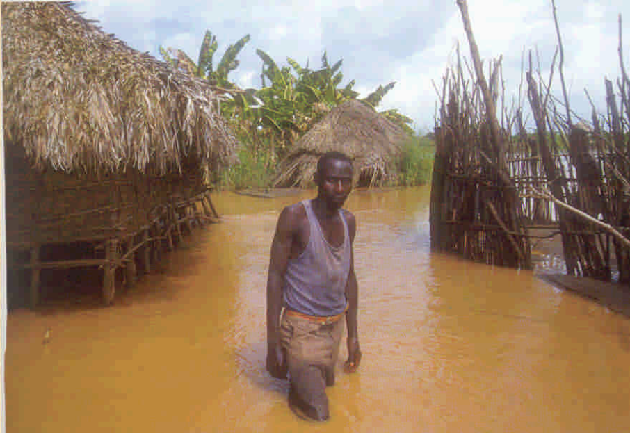
El Niño floods in Rhoka Village, Tana River Valley, Kenya