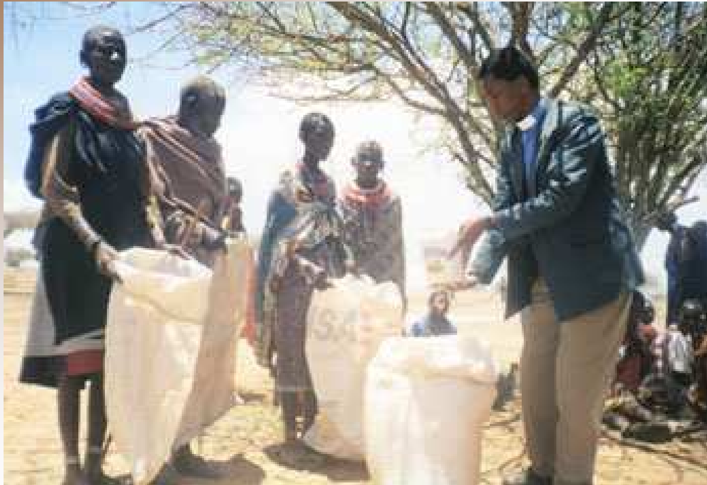
Food Relief in Kajiado CCS