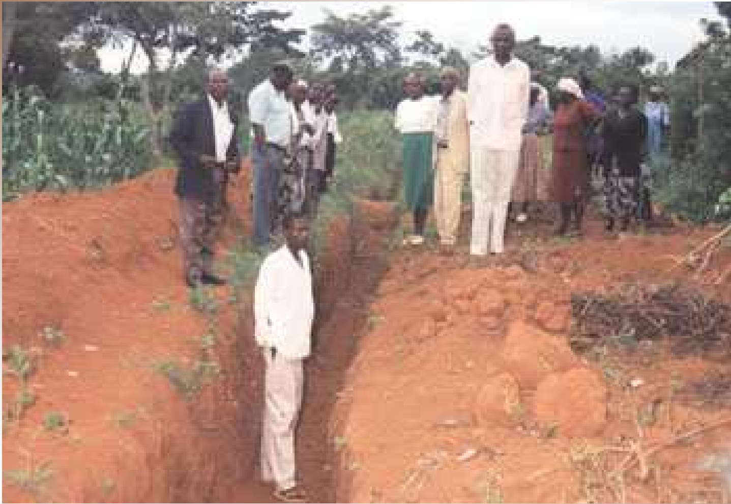
Soil Conservation efforts in Nyanza CCS