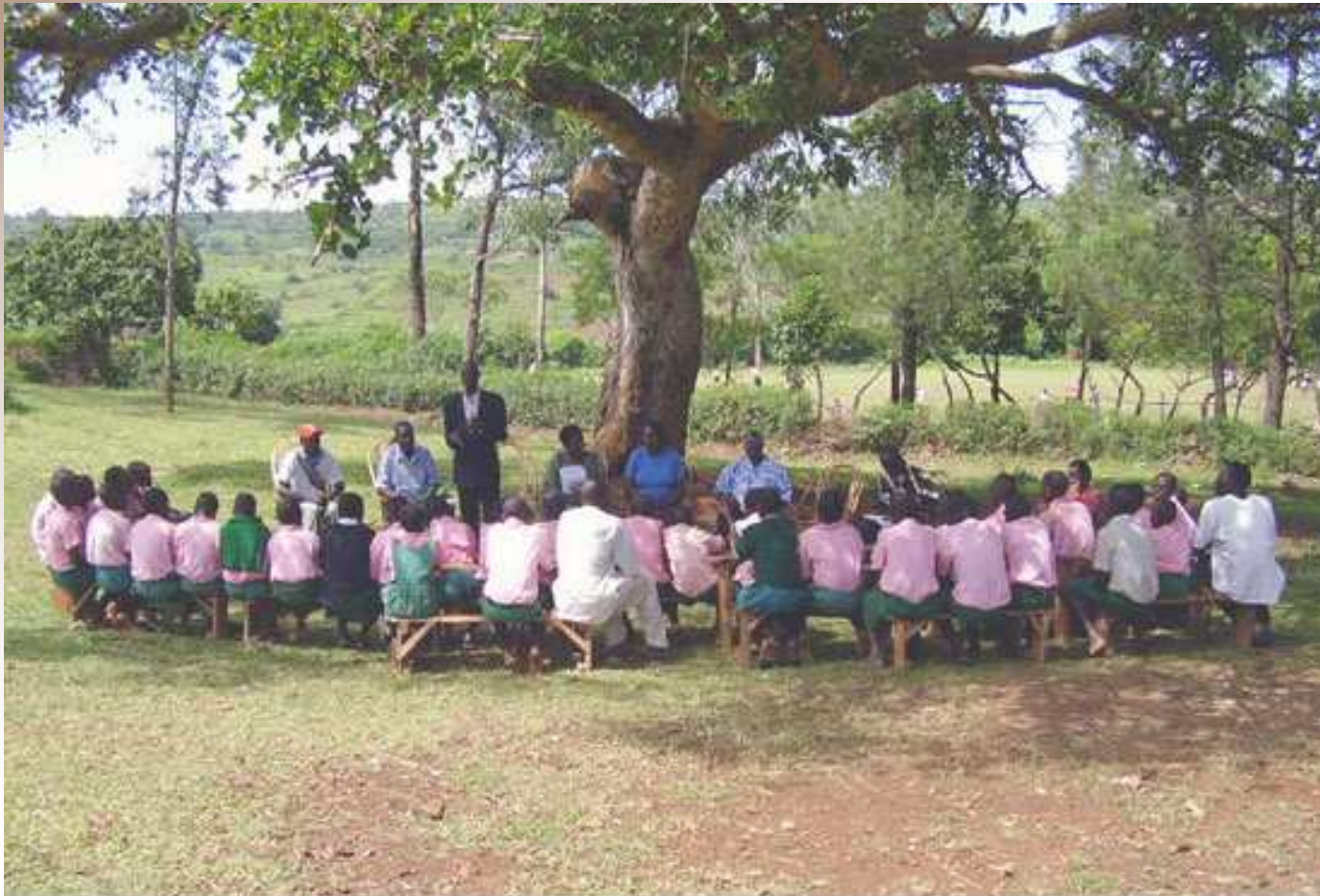
Peer Educators - life skills