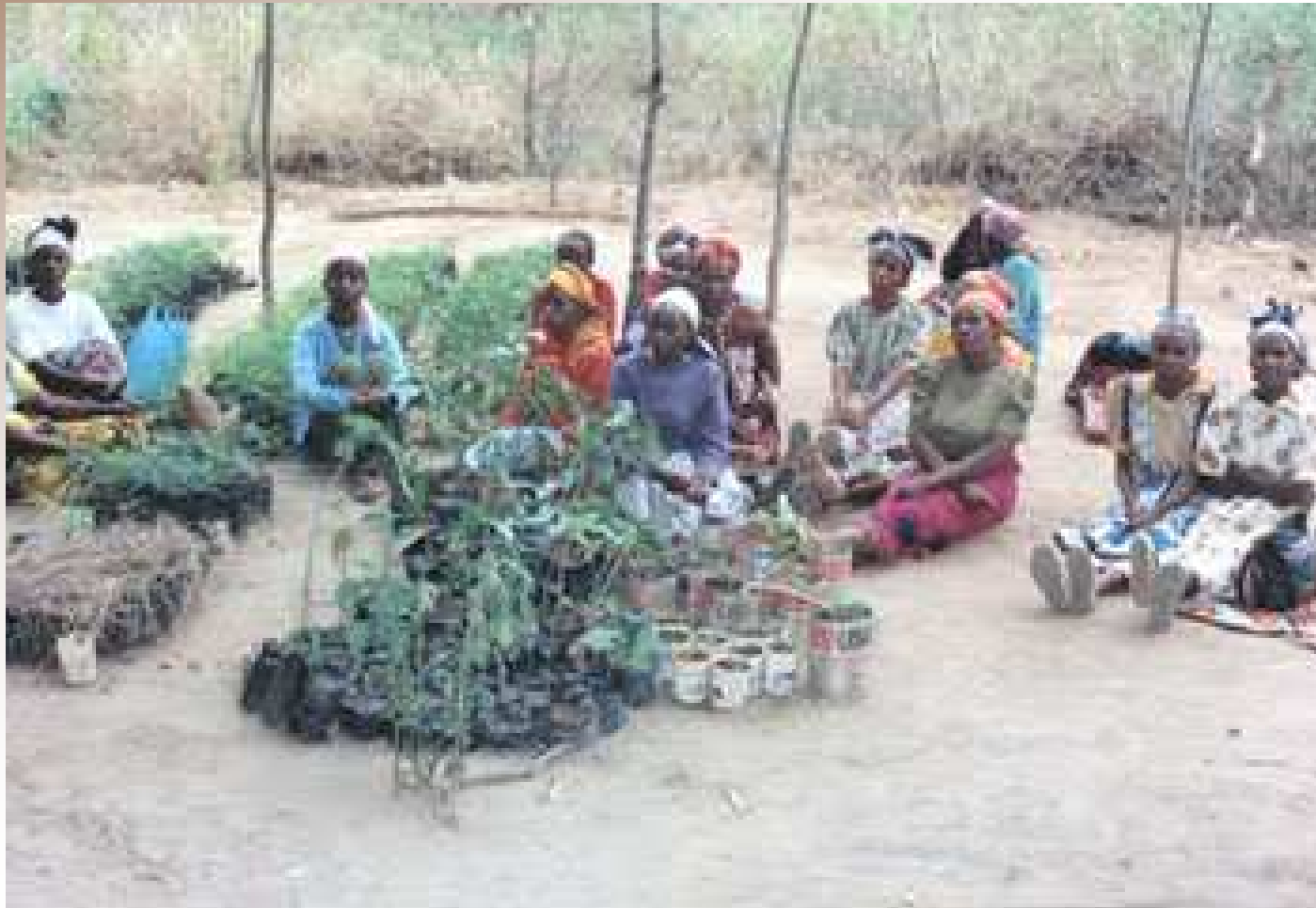
Environmental Care in Ukambani CCS