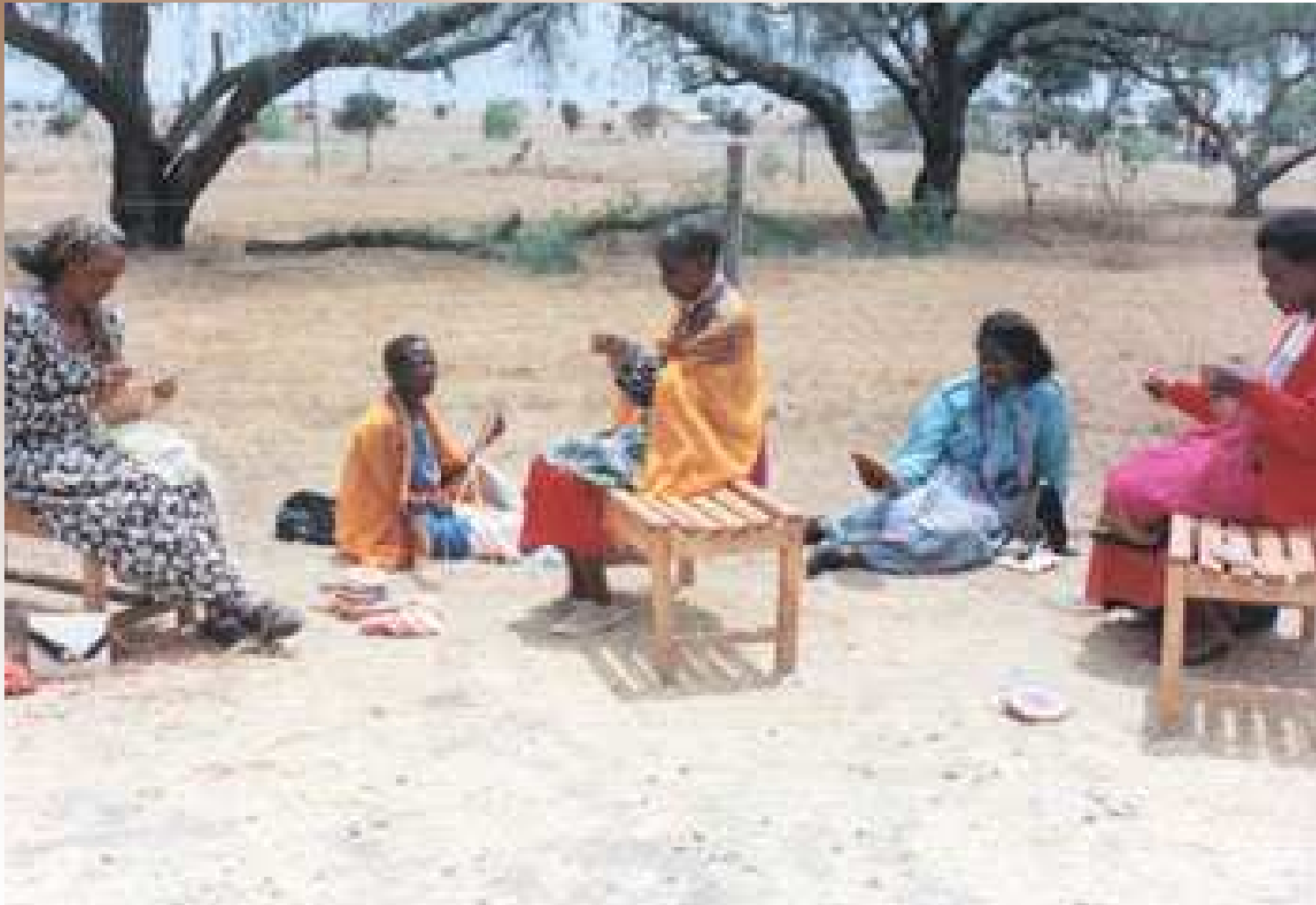
Economic Empowerment of Women