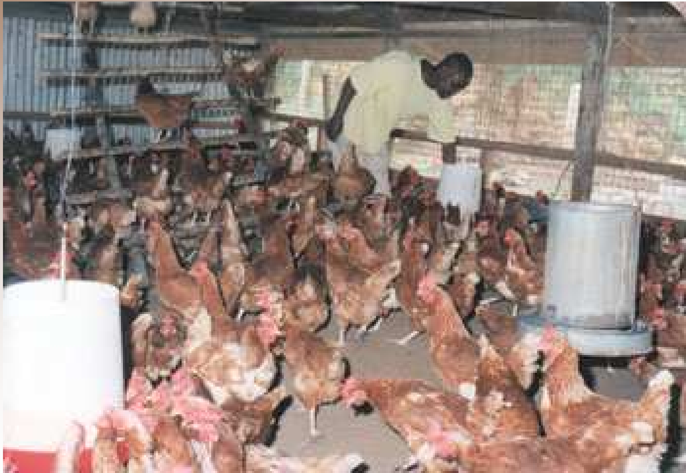
Poultry Keeping in Isiolo