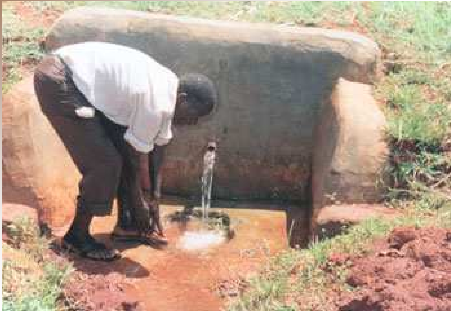
Providing Safe Drinking Water in Nyanza CCS