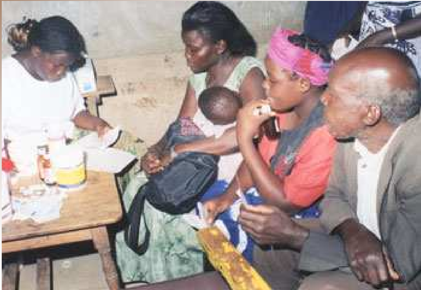
Providing Health Services in CCS Mt. Kenya East