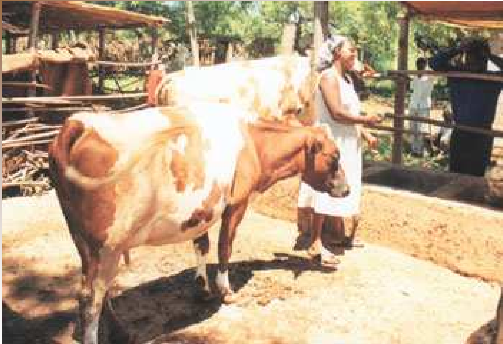
Improved Dairy Farming in Nakuru CCS