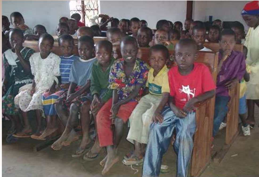
The Good News Orphans in Mwatate