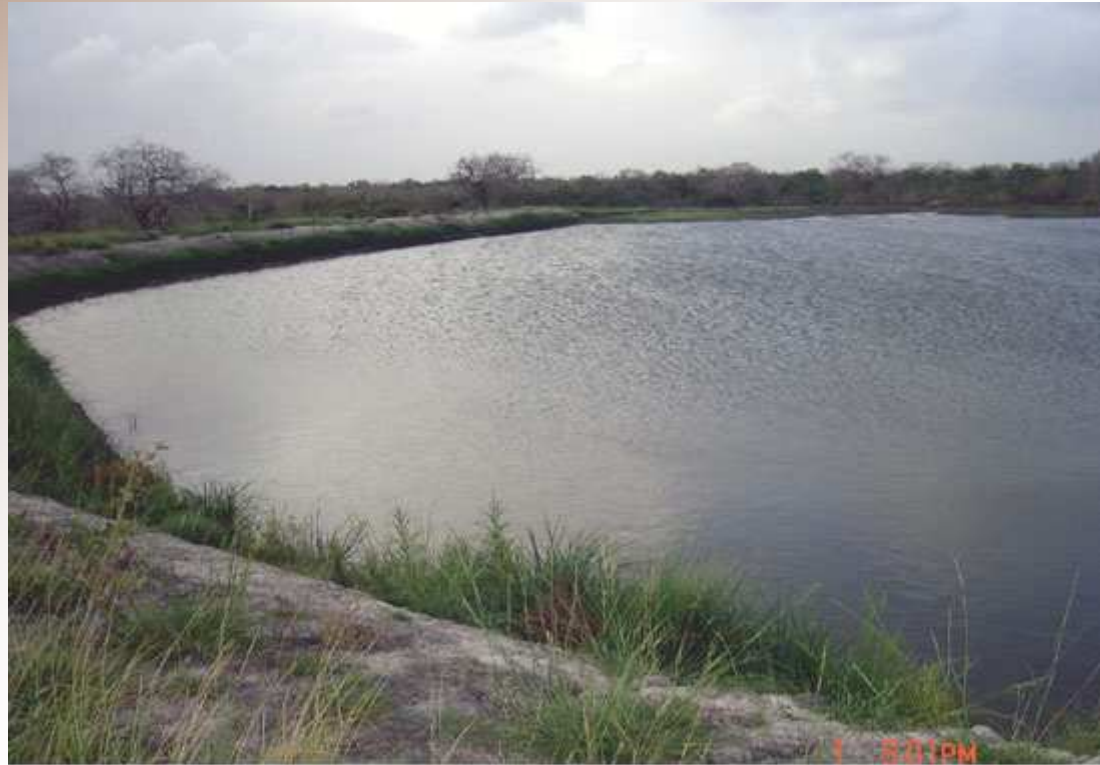
A long lasting dam at Chapung