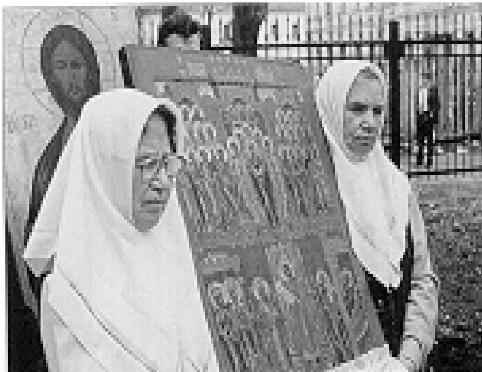
Believers from the Pokrovskaja church in Moscow.

spirituality and personal beliefs. Interestingly, religion/spirituality was not included initially by the researchers in their proposed statement about the key components of one's quality of life. But the WHO 'grassroot' regional centres in various countries, in reviewing the proposal, consistently suggested this as an important dimension. As a result, WHO's six broad domains of quality of life seen as significant across cultures include: 1) the physical domain, 2) the psychological domain, 3) one's level of independence, 4) social relationships, 5) one's environment, and 6) one's spirituality/religion/personal beliefs.