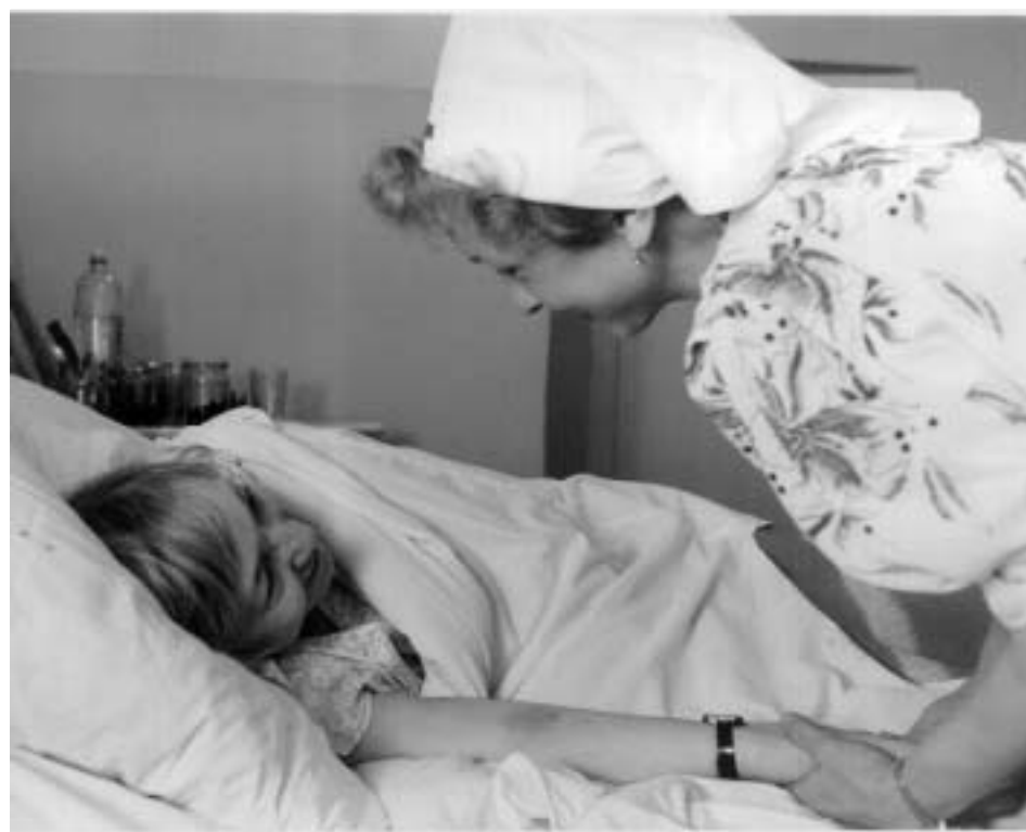
A sister from the Orthodox Church visiting an old patient in Novosibirsk, Russia.