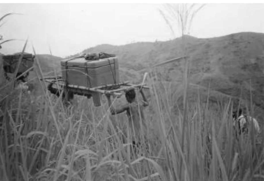
Transport challenges in DRC

Only 2 provinces are accessible by roads from the capital. The 9 other provinces can only be reached by air or water, mostly in rather unsafe conditions. The poor state of transport networks (road, air, train and river) strongly affects the movement of people and makes the delivery of goods and follow-up visits between the provinces and even inside the provinces difficult and dangerous.