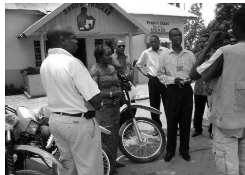
Delivery of motorbikes to the districts

It is not enough that vaccines are available at the vaccination sites. They also have to be