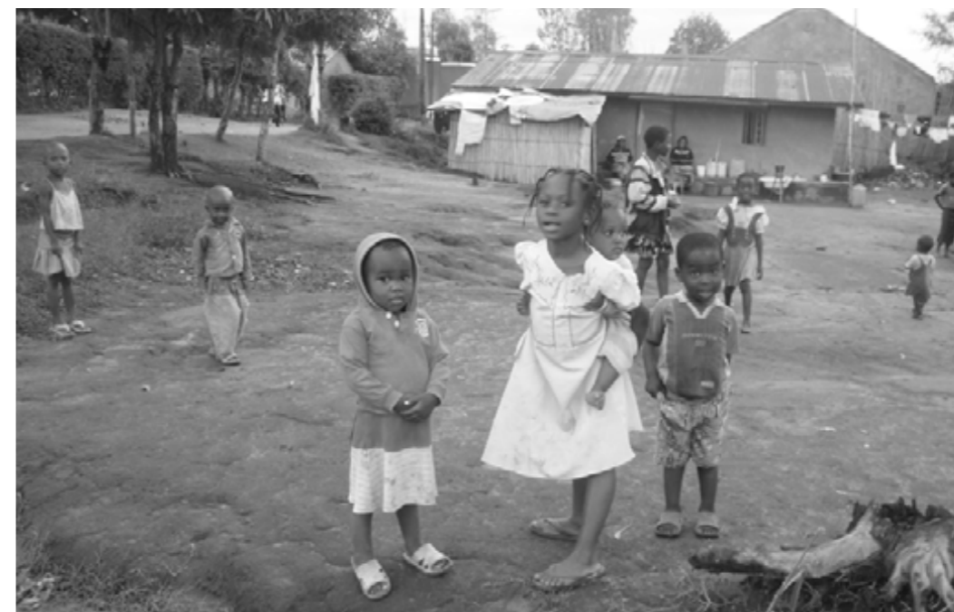
Children caring for children

A benefit of the radio health messages is that the illnesses being discussed were not ones that only children experienced. Adults, for years, were suffering the consequences of treatable chronic illnesses, not realizing that their lack of energy and body aches were