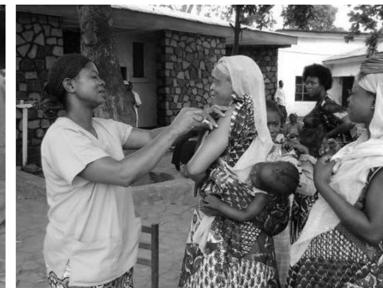
A vaccination campaign in September 2008

stored correctly, the sites have to be accessible and the vaccination activities must reach as many children as possible, through several different strategies. With funding from the AXxes and GAVI project, the civil society organizations (CSOs) have been able to offer - and still offer - additional support to the vaccination services through the supply of fuel (for refrigerators and freezers) and spare parts for the maintenance of the cold chain to preserve vaccines, donations of management tools and vehicles (motorbikes for the distribution centres 2 and districts 3 , bicycles for the subdistricts 4 ), donation of computer tools for the distribution centres, capacity building for the teams working at the districts, financial support to the organization of supervision and monitoring, etc. Through a partnership with Becton Dickinson, the CSOs were also able to provide the districts with syringes for dilution and injection.